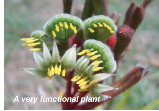
A very functional plant

For mass planting in large landscapes, this along with Gold Velvet are probably the pick of all the range. Its flowers are also very attractive, with both red and green highlights. The flower stem generally grows to approximately 1.0 to 1.4 metres in height. In show gardens it is a good idea to remove the older flowers in late summer, but for mass planted areas this may be difficult, so the stems can be left to decay on their own.