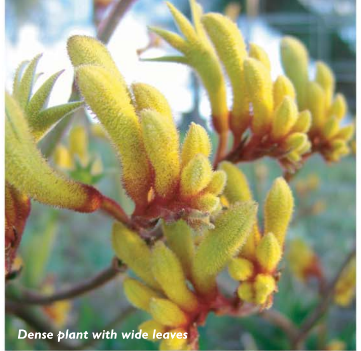
Dense plant with wide leaves

For landscaping and low maintenance gardens, Gold Velvet's foliage performs as good as Regal Velvet. It has very clean foliage, has magnificent yellow flowers, which are shorter than Regal Velvets flowers, and is still a good dense plant. Its leaves are wider than Regal Velvet, so its foliage is distinctively different.