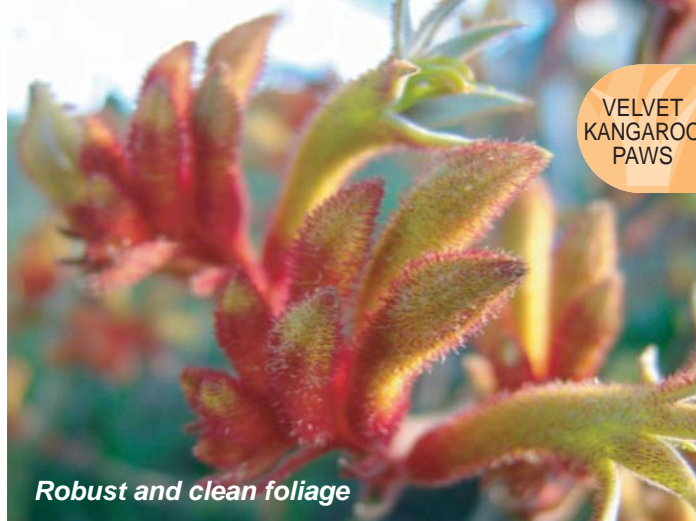
Robust and clean foliage

The colour almost glows. Its foliage is again very clean and robust but not as dense as Gold or Regal Velvet's foliage, so they tend to let weeds invade more easily. Its bold amber flowers reach around 1 to 1.2 metres tall, and its foliage reaches 40 to 50cm tall.